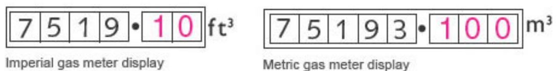
Figure 1: Imperial and gas meter displays

There are three different types of electromechanical induction meters which display the readings in different ways - they are standard, digital and dial meters 1 .